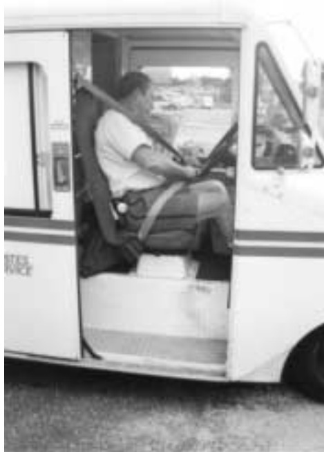
Exhibit 3-5.8 Seat Belts and Vehicle Doors