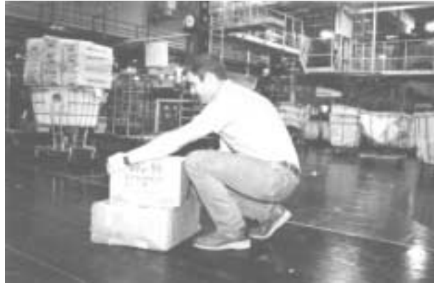
Exhibit 8-12.4 Proper Lifting Technique