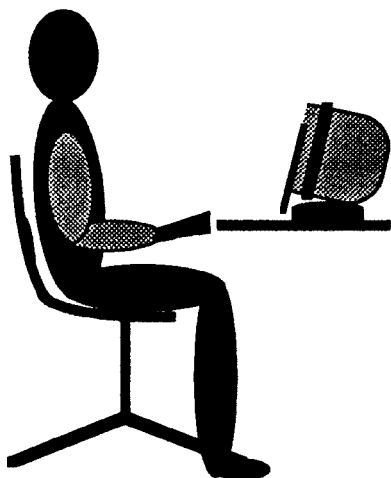
Exhibit 8-23.2 Workstation Chair Adjustments